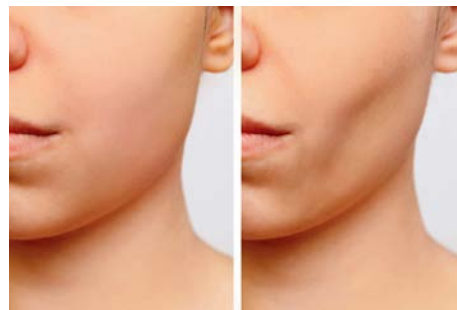
Buccal fat removal surgery involves making a small incision inside the mouth to remove fat tissue, thereby making the lower cheek appear contoured and slimmer. REPRESENTATION PIC